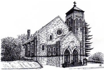
Our Lady Help of Christians Church Lykens, PA

Parish Office Hours: Monday - Thursday 9am – 3pm Fridays 9am – 1pm By Appointment Only