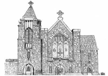
Sacred Heart of Jesus Church Williamstown, PA

Website • www.catholiclykenswilliamstown.org